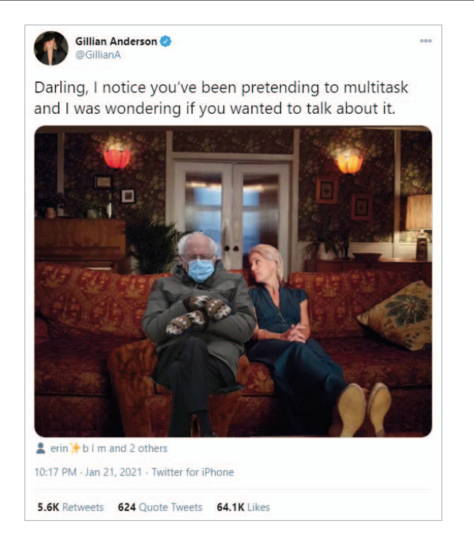
Fig. 6: Celebrities such as actress Gillian Anderson contributed to election memes spreading, sharing variations of "Bernie's Mittens"

depicted as "'cool' and culturally informed both in memes and ... fan writings" (2020) which are widely created and shared. This relatable image soon lost all political significance, becoming seemingly a floating signifier without clear meaning or reference. The iconic photograph of Bernie in his mittens was inserted into anything – from pop cultural imagery such as the Totoro meme<sup>6</sup> to the NASA rover landing – and reproduced in many media, be it deep faked video clips or as a crocheted doll.