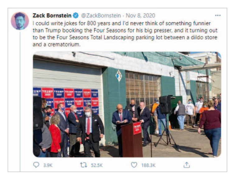
Fig. 4: A photograph of Trump's press conference, commented on by @ZackBornstein

Another way Trump's loss of the election was celebrated in meme-format occurred in the form of event references, such as the slow vote counting in Nevada (e.g. Haylock 2020) or in response to Trump's final press conference. After it was announced that he would be giving a press conference not in the Four Seasons hotel but Four Seasons Total Landscaping parking lot, many memes were created that alluded to this event.