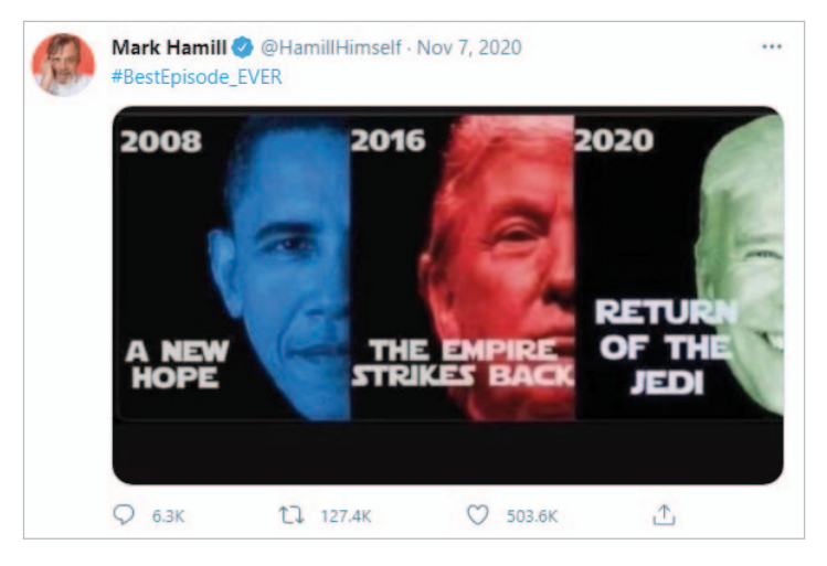
Fig. 2: The titles of the original Star Wars trilogy imposed on the American presidents from 2008 to 2020 (@HamillHimself, 2020).

Hence allusions to popular movies and TV shows form the base of many memes framing the weeks of the election week. Particularly references to such staples of geek fan culture as Star Wars, Marvel, and Game of Thrones were abundant, with even Mark Hamill, the actor playing Star Wars' Luke Skywalker, sharing a highly popular meme after the election that was liked 500k times: