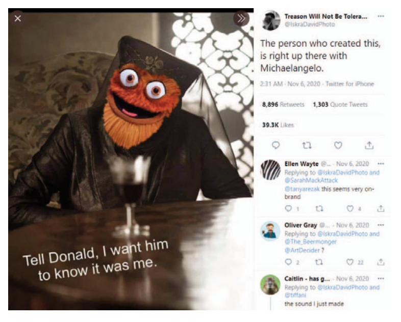
Fig. 3: Example of Gritty meme with high intertextuality by @IskraDavidPhoto (2020)

While the framing is similar to the previously discussed examples, in memes such as this<sup>3</sup>, several elements come together to create the multi-layered joke of the meme: Gritty's head is super-imposed on Olenna Tyrell, a character from HBO's Game of Thrones series. The show's quote is slightly altered to refer to Donald Trump, once again taking the place of a hated villain, this time Game of Thrones ' king Joffrey. Denisova (32) points out that "memes are coded messages and therefore can be confusing for various people: members of the audience may have varying abilities and skills to read the 'code'" in such cases. Here it is both necessary to know the context of the quotes – Olenna admitting to the murder of a tyrant king – and the event it references, with the implied metaphorical murder being Trump's loss of the election, which was attributed to the votes of leftist Philadelphians, as Pennsylvania flipping blue was seen as the key event cementing Biden's victory, metonymically referenced through Gritty.