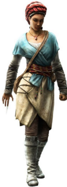
Figure 3: Aveline's "Slave outfit". Aveline is pictured from the front, and shown to be wearing a simple tunic, a pair of trousers and boots, a blue blouse and a red headwrap. There are no weapons shown.

This variety of outfits highlights the possibilities and limitations women had to face during this historical period. This becomes especially clear in the differences between the "Assassin outfit" and the "Lady outfit". The "Slave outfit" is, in this respect, a bit of a strange element in the mix, because in terms of what the player can and cannot do it, is in between the "Assassin outfit" and the "Lady outfit". This would suggest that enslaved people had more options as to how they could move around and carry themselves. This, of course, is not a historically accurate depiction of the period at all and again points to the idea that the developers may have glossed over the historical truth of what slavery really was like, in favor of creating a game that is appealing and 'fun' to play.