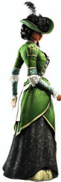
Figure 2: Aveline's "Lady outfit". Aveline is pictured

from the side, looking to the right. She is wearing a green dress and a matching green hat that is decorated with a feather. She is not shown to be wearing any kind of armor or carrying weapons.