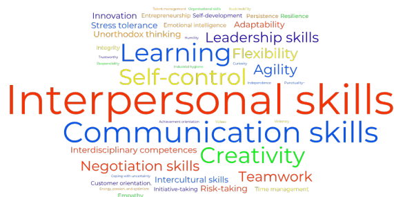
(c) social competencies