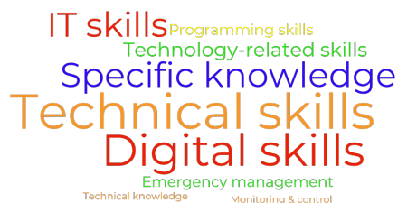
(b) functional competencies